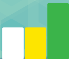
Process mining software licenses