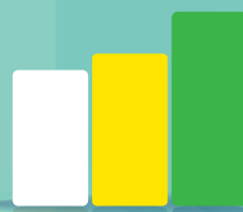
External consulting and advisory services