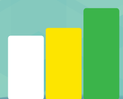
Internal team dedicated support for ongoing process insights