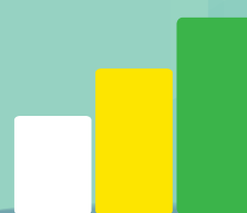
Internal team supporting product implementation and integrations