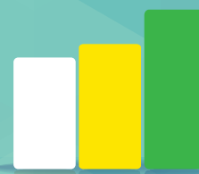
Third part services partner product implementation and integrations

Sample: Study by HFS Research and Genpact; 400 executives from G2000 enterprises