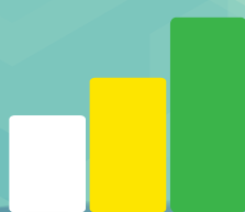
Process discovery software licenses