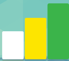
External team dedicated support for ongoing process insights